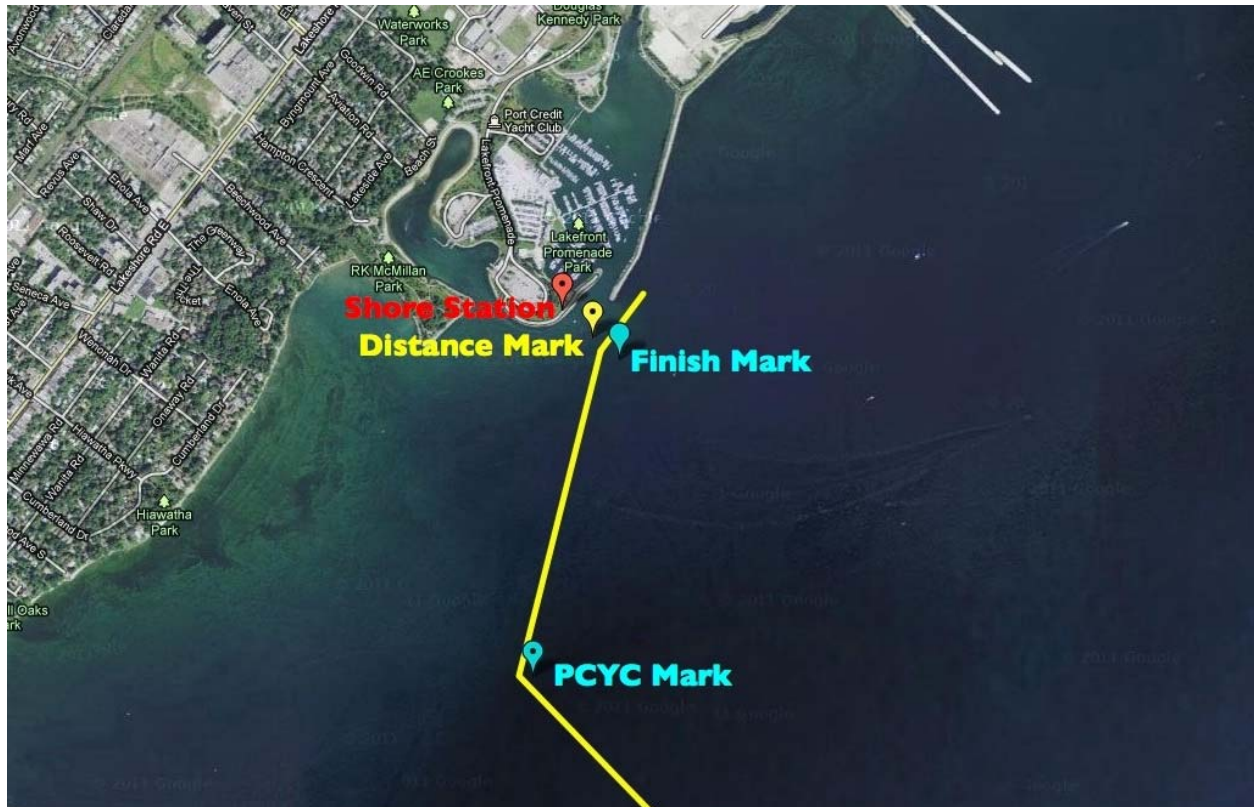
Diagram 2 The Finish – Long Distance Race Only

The Starting Area After the first warning signal for a race and prior to her warning signal, a sailboat shall keep clear of the starting area that extends one-quarter of the length of the starting line ahead of and behind the starting line. It shall also extend one-quarter of the length of the starting line past either end of the starting line