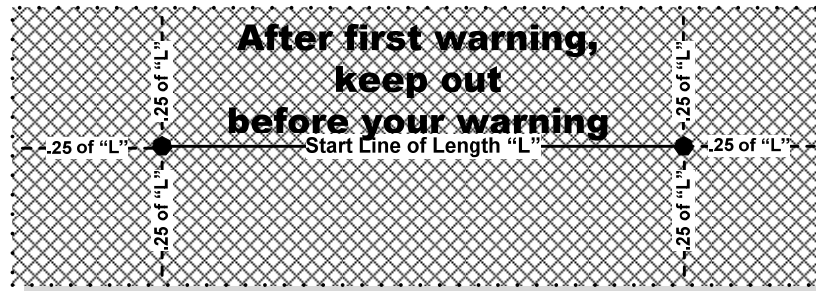
The Starting Area

After the first warning signal for a race and prior to her warning signal, a sailboat shall keep clear of the starting area that extends one-quarter of the length of the starting line ahead of and behind the starting line. It shall also extend one-quarter of the length of the starting line past either end of the starting line