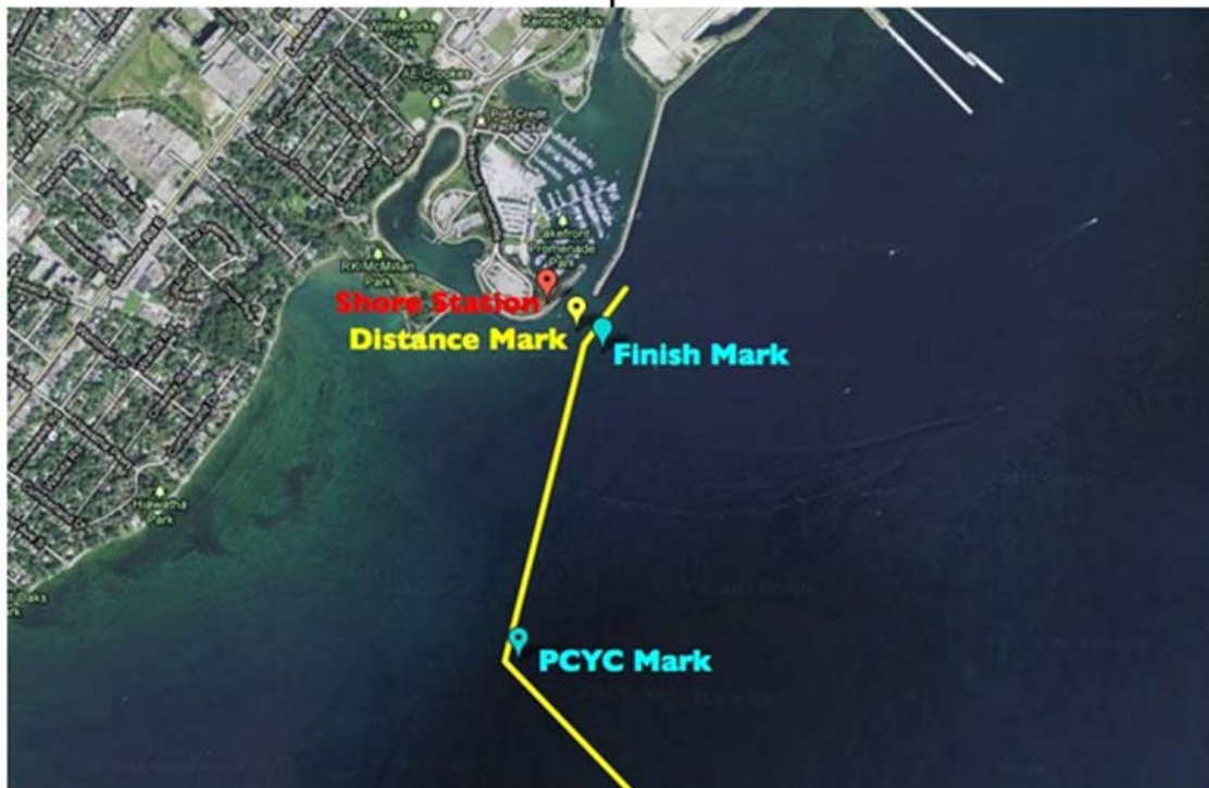
Diagram 2 The Finish

After the first warning signal for a race and prior to her warning signal, a sailboat shall keep clear of the starting area that extends one-quarter of the length of the starting line ahead of and behind the starting line. It shall also extend one-quarter of the length of the starting line past either end of the starting line