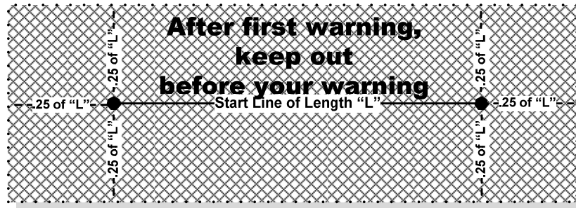
Diagram 1 The Starting Area