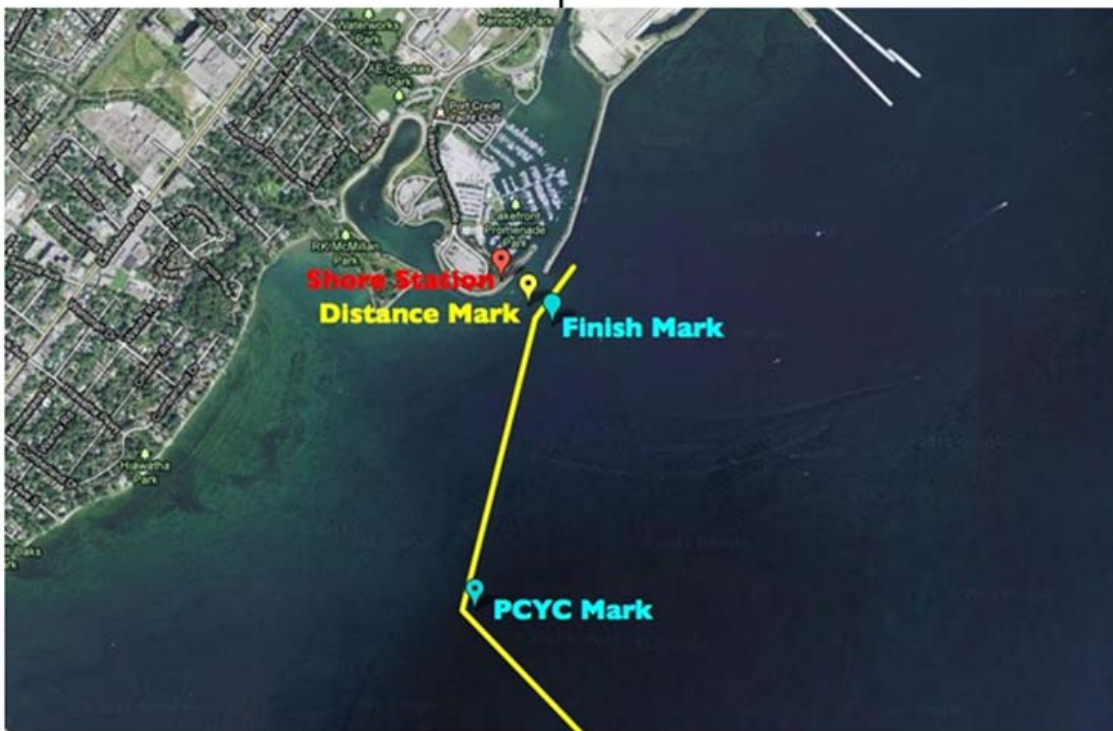
Diagram 2 The Finish

After the first warning signal for a race and prior to her warning signal, a sailboat shall keep clear of the starting area that extends one-quarter of the length of the starting line ahead of and behind the starting line. It shall also extend one-quarter of the length of the starting line past either end of the starting line