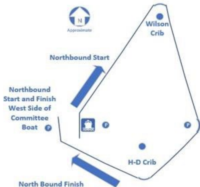
Figure 3: North route – Course B