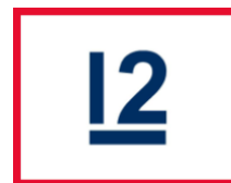
12mR Yacht Club Host