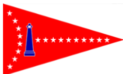
Ida Lewis Yacht Club Organizing Authority