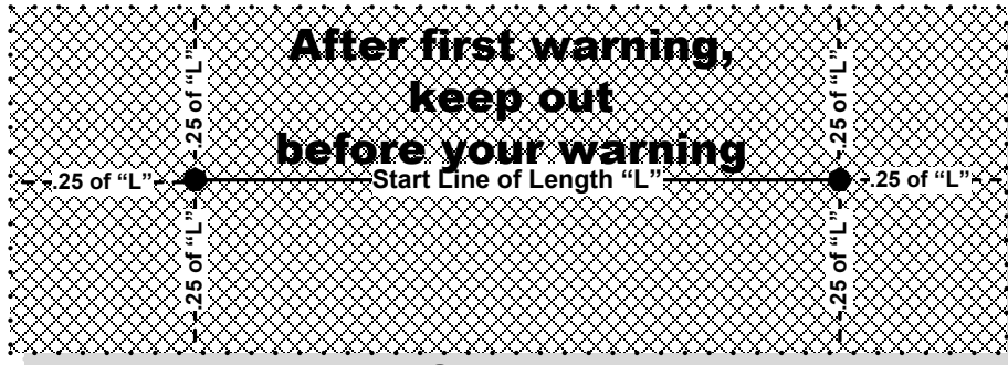
The Starting Area

After the first warning signal for a race and prior to her warning signal, a sailboat shall keep clear of the starting area that extends one-quarter of the length of the starting line ahead of and behind the starting line. It shall also extend one-quarter of the length of the starting line past either end of the starting line