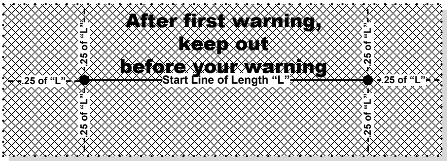
The Starting Area

After the first warning signal for a race and prior to her warning signal, a sailboat shall keep clear of the starting area that extends one-quarter of the length of the starting line ahead of and behind the starting line. It shall also extend one-quarter of the length of the starting line past either end of the starting line