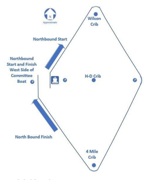
Figure 1: North route - A