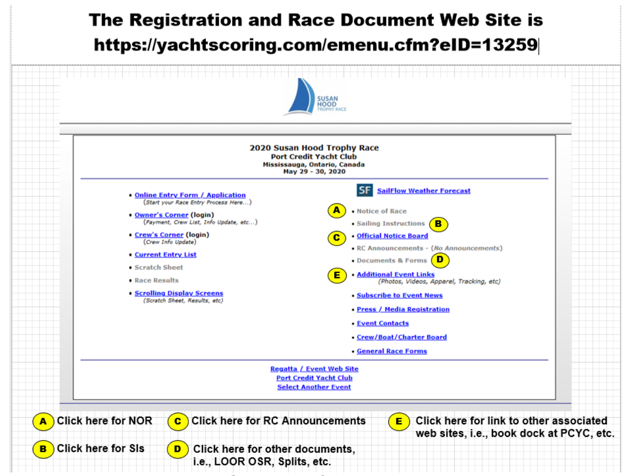
Diagram 5 Location of Other Documents on Race Document Web Site