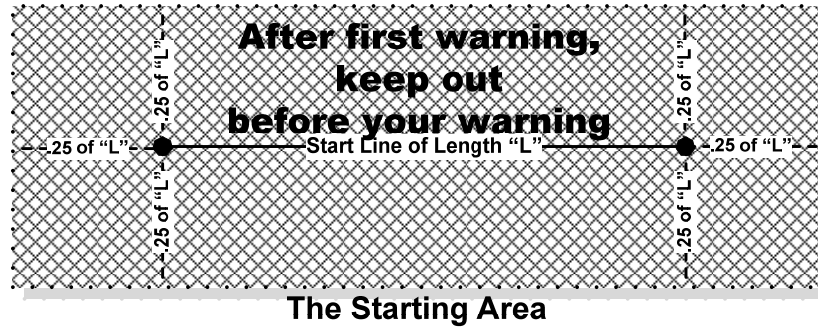
Diagram 1 The Starting Area – All Races

After the first warning signal for a race and prior to her warning signal, a sailboat shall keep clear of the starting area that extends one-quarter of the length of the starting line ahead of and behind the starting line. It shall also extend one-quarter of the length of the starting line past either end of the starting line