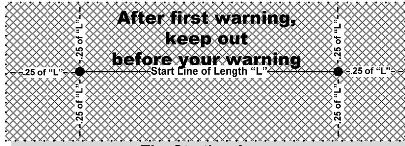
Diagram 1 The Starting Area

After the first warning signal for a race and prior to her warning signal, a sailboat shall keep clear of the starting area that extends one-quarter of the length of the starting line ahead of and behind the starting line. It shall also extend one-quarter of the length of the starting line past either end of the starting line